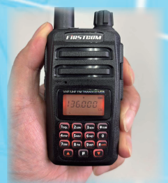
*Approximate size reference